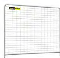
FENCE (5'11", 8'2", 10'6")