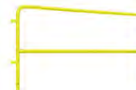
GUARD RAIL (5'11", 8'2", 10'6")