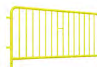
BARRIER (5'11", 8'2", 10'6")