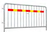
BARRIER (5'11", 8'2", 10'6")