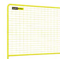
FENCE (5'11", 8'2", 10'6")