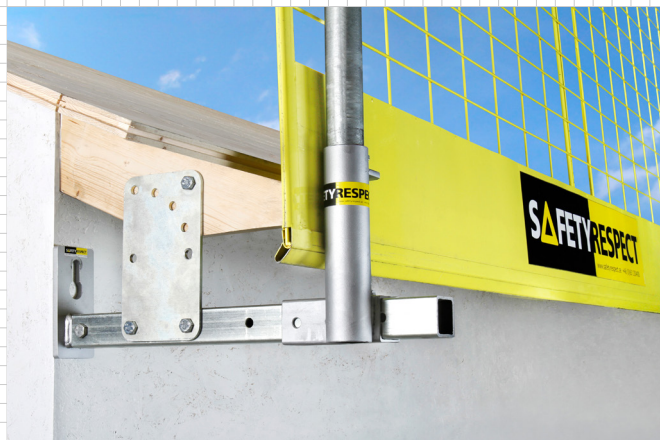
FLEX EAVE BRACKET